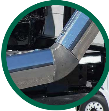
45° Pivot Offset Option